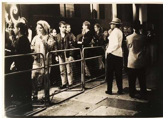
Ingrid Pollard, 'Performance outside The Fridge, Brixton', c.1990