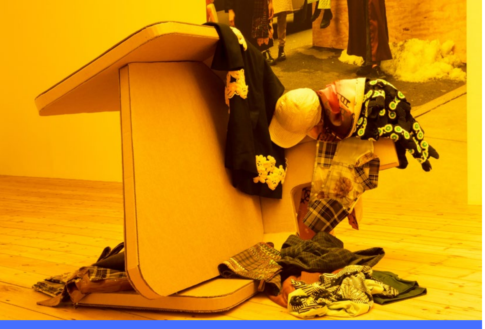
CFGNY, Collecting Dissonance, Auto Italia, 2021