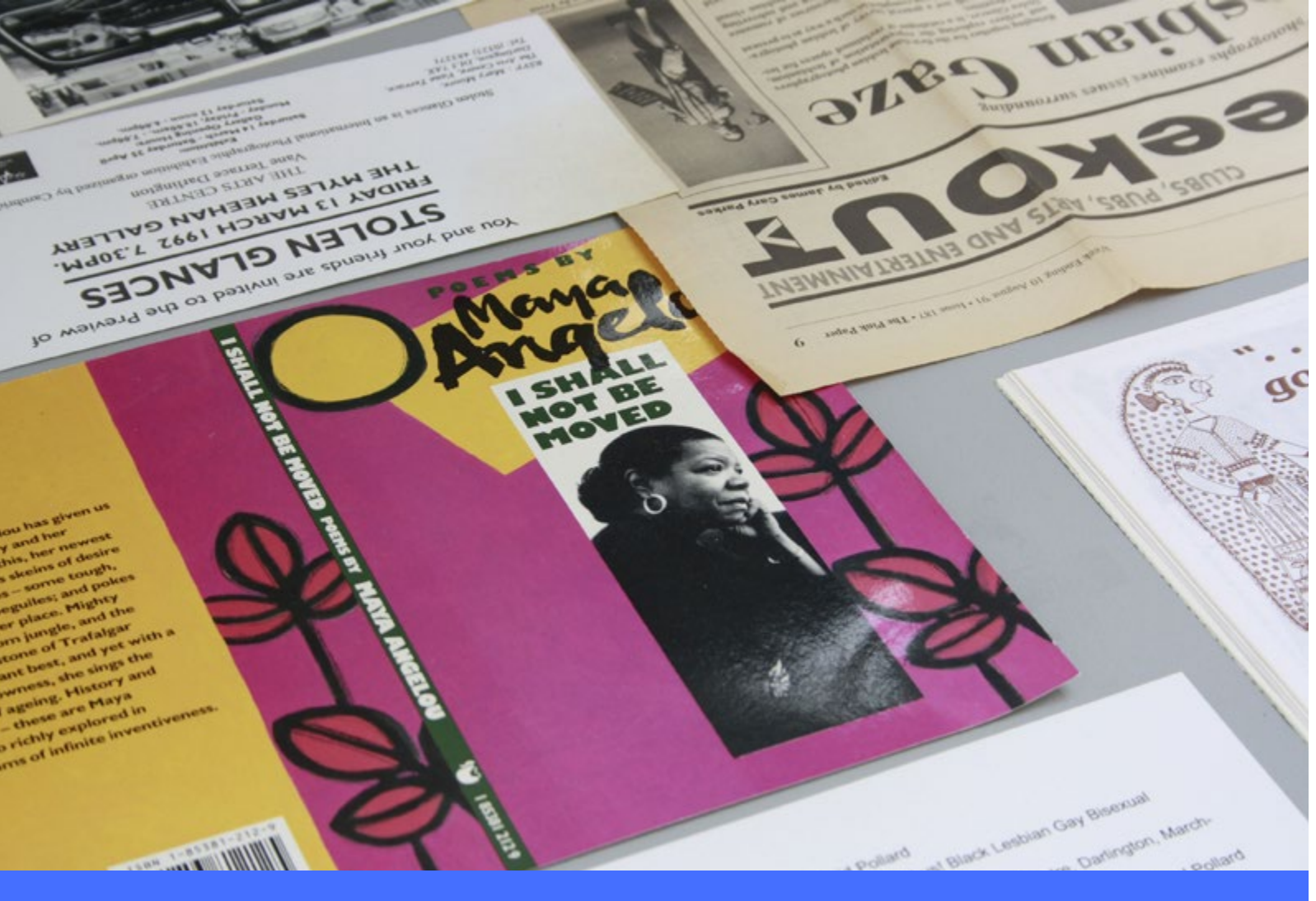
Ingrid Pollard, Poems by Maya Angelou , Auto Italia, 2020