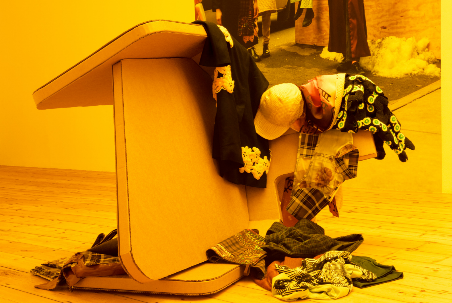
CFGNY, Collecting Dissonance , Auto Italia, 2021