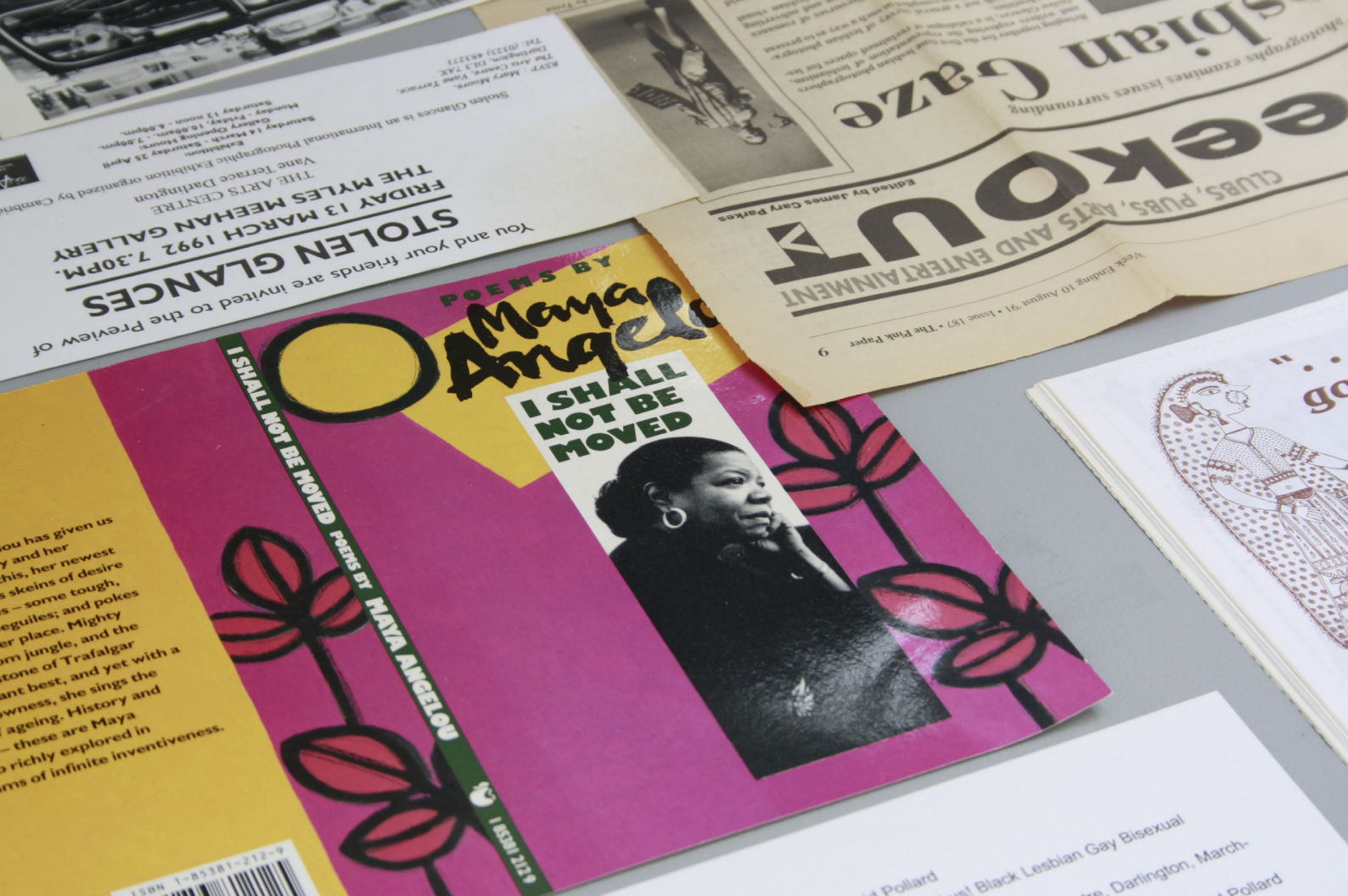
Ingrid Pollard, Poems by Maya Angelou , Auto Italia, 2020